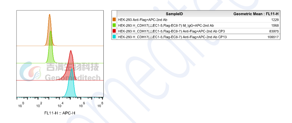
Figure 2 | The passage stability of the H_CDH17(\Delta EC1-5,Flag-EC6-7) HEK-293 Cell Line (Genomeditech/GM-C31207) was determined by flow cytometry using Anti-Flag mIgG1 Antibody (Genomeditech/GM-30726AB).